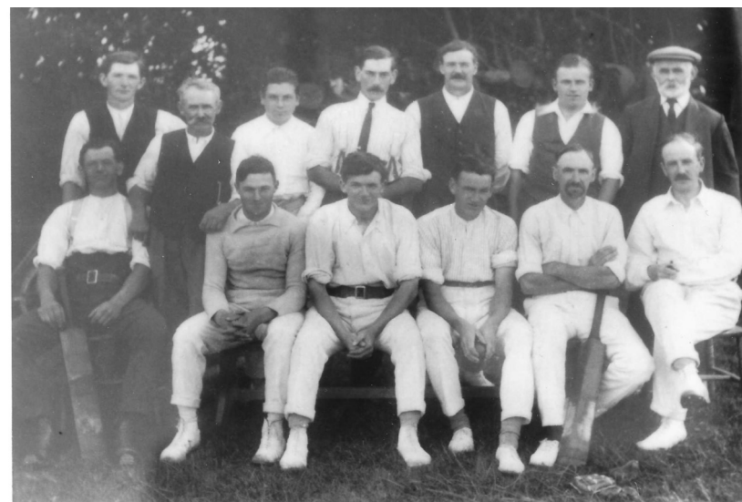
Photo Lezant Cricket Team circa 1940