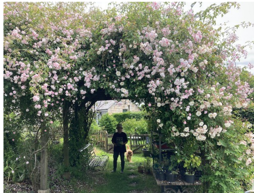
Clamland - One of the Gardens on the Garden Visits Evening (page 11)